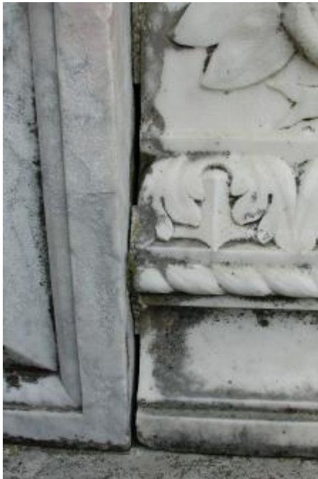
Open mortar joint (typical), November 5, 2002

4.2 All three tombs require additional cleaning and the re-pointing of all mortar joints. The platforms, on which the tombs rest, will require some minor repairs, and the re-pointing of the bed joint beneath the base moldings. (The Robert Carter tomb has an additional bed joint between the two levels of the platform.) Platform head joints should probably be left open to permit drainage of surface water directly into the soil.