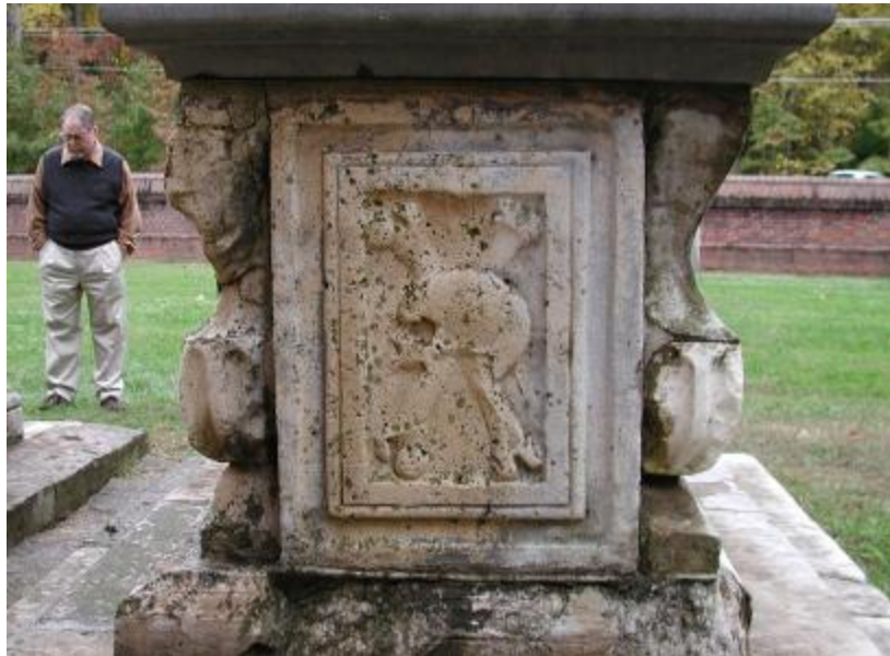
Robert Carter, west elevation, November 5, 2002, replica panel