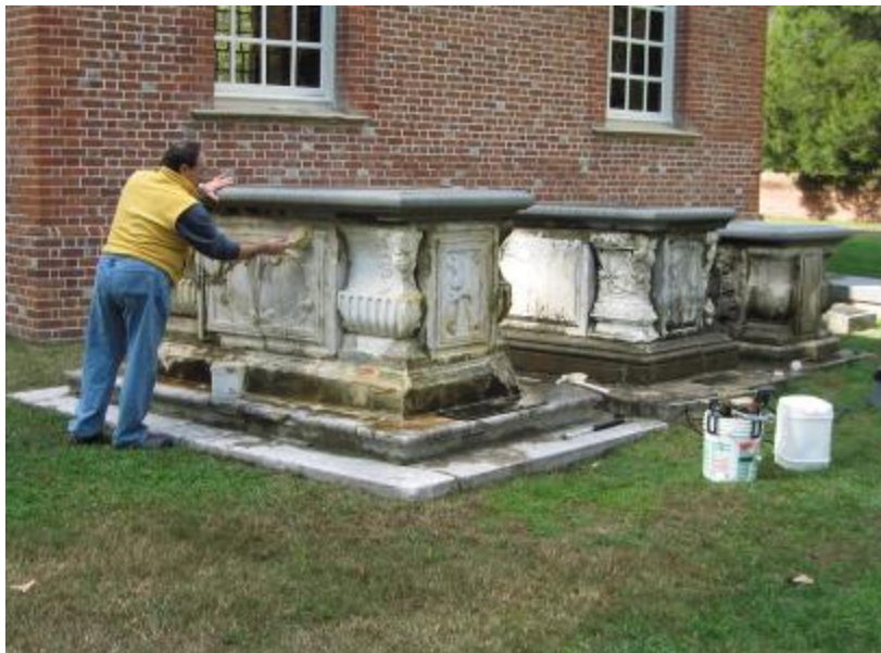
Removal of biological soiling to facilitate inspection, November 4, 2002

The field work commenced on November 4 with an initial inspection of each elevation, and some additional digital photographs were taken. Biological soiling, a common condition in warm, moist climates, can make it difficult to characterize construction materials and to record their condition. The tombs were therefore cleaned with D/2 Architectural Antimicrobial (Cathedral Stone Products, Inc., Hanover, MD 21076). The product was applied with hand-held pump sprayers, and allowed to remain on the surface for several minutes. It was then manually scrubbed with wet brushes, and finally rinsed with a small pressure washer.