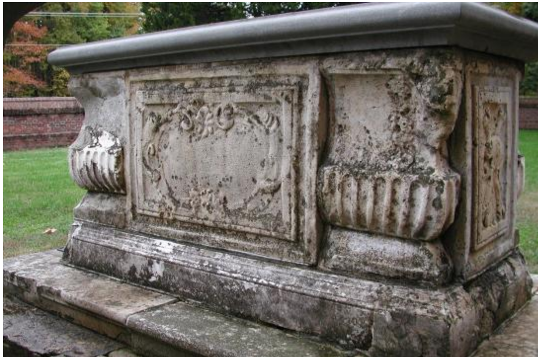
Robert Carter, north and west elevations, November 5, 2002, panel and NW corner are replicas