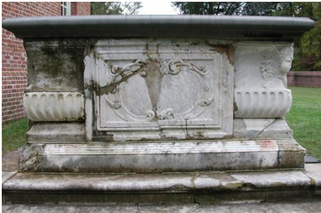
Robert Carter, south elevation, November 5, 2002; note mis-alignment of panel fragments probably assembled in 1927