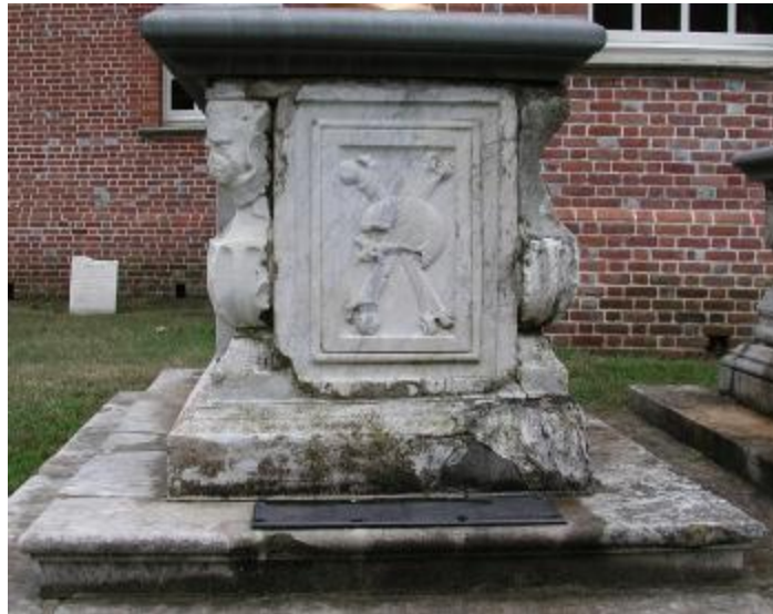
Robert Carter, east elevation, November 5, 2002, showing deterioration of base molding

West , Portland limestone. Deterioration, with extensive loss. Detached fill at north end.