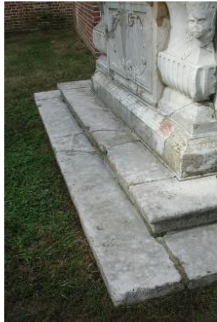
Platform, Robert Carter, south elevation, November 5, 2002

Tomb-by-tomb recommendations are given in sections 4.2.1 through 4.2.3, below. Information is provided in the form of annotated drawings, which identify specific locations and work items. Materials and methods for each conservation process will be defined in detail in our Phase II report.